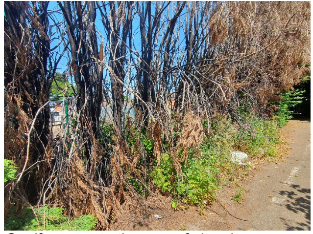
Conifer trees to the rear of site along footpath