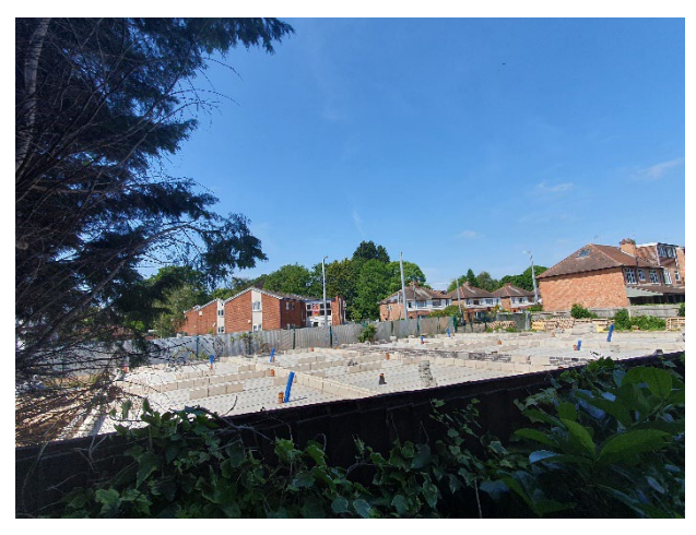
Wider site, permission being constructed under 21/01055/FUL – facing north west from rear footpath