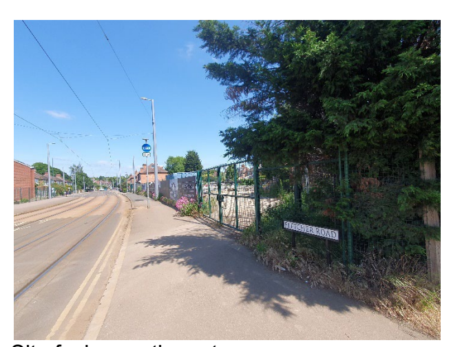
Site facing north east