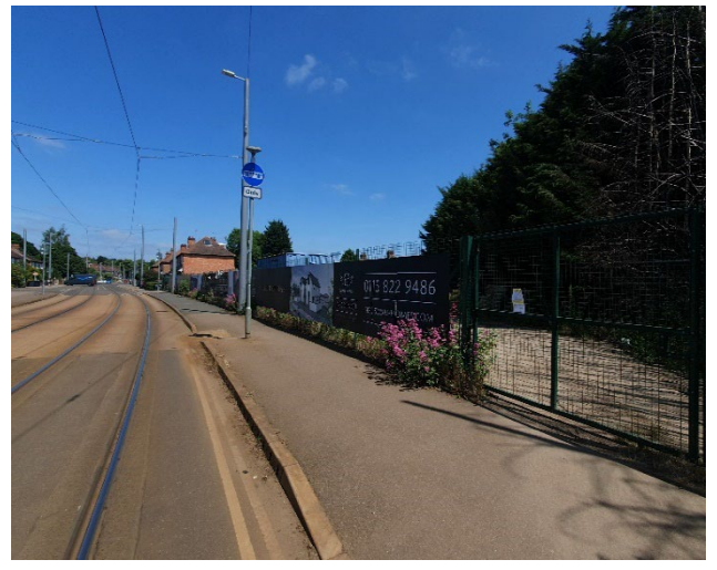
Site facing north east