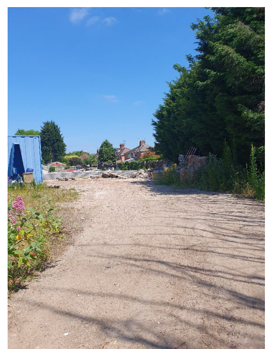
Site facing north east